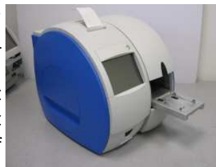
The Enigma ML system

The new Enigma ML also drew a huge amount of interest from many of the attending trade visitors and media and a substantial amount of investment and business opportunities were gained, proving that the ML will be a favourite amongst medical professionals and a leader in its field.