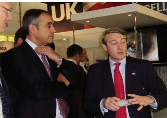
The Chairman (right) presents the ML to an enthralled Lord Darzi